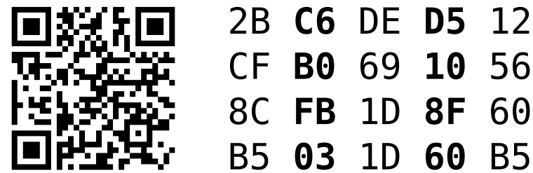
Figure 1: QR Code and Fingerprint

The security of E2EE depends on verification of the exchanged keys which is often done by scanning QR codes containing a fingerprint that is (statistically) unique to the generated key. Some apps require you to only verify one fingerprint for all devices, but others require you to verify one fingerprint for every device. Some apps send notifications in the conversation notifying you when your contact's fingerprint changes, possibly suggesting something nefarious. Some apps unfortunately do not do this. You must verify all fingerprints for all devices, and if a fingerprint changes, you must re-verify it otherwise all of your security could be undone. Further, some chat apps do not share devices you've verified with your other devices, and this poor UX requires you to verify each of your contacts' devices from each of your own devices.